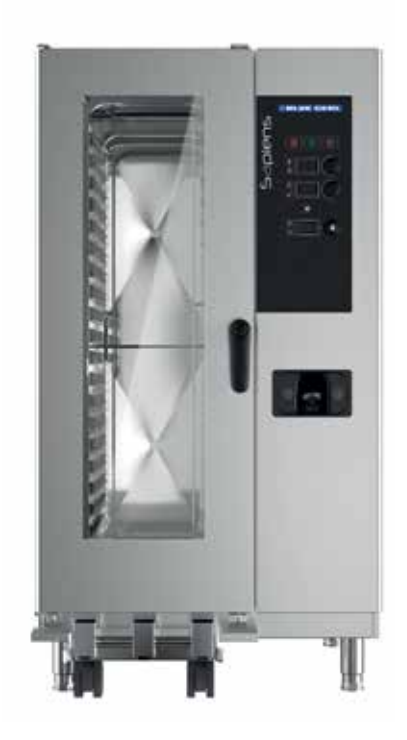
21RSDW (20x 1/1 GN)