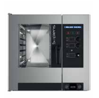
7RSDW (7x 1/1 GN)