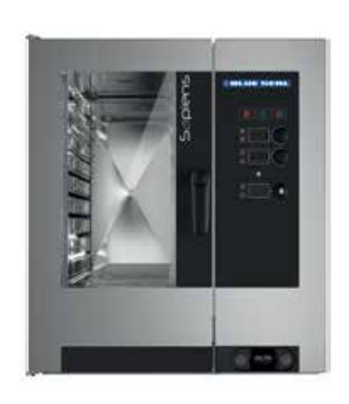
10RSDW (10× 1/1 GN)