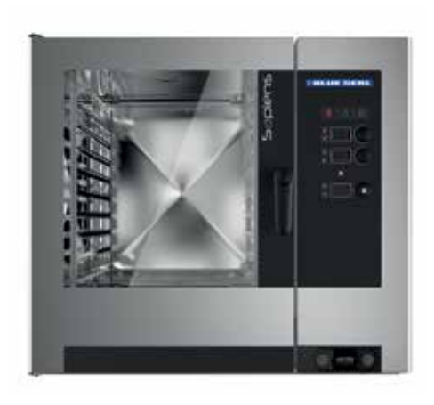
20RSDW (20 × 1/1 GN, 10 × 2 1/1 GN)