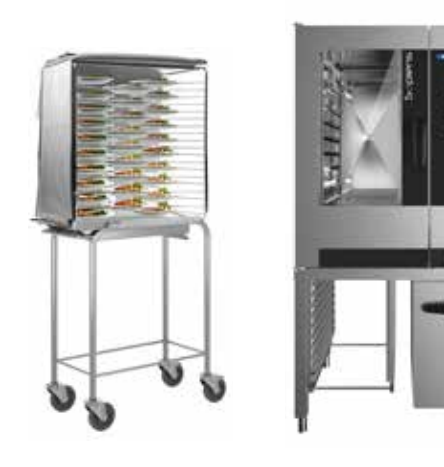
A RESETTING OF TEMPERATURE AND A FINISH ALWAYS PERFECT WITH THE SYSTEM BLUE SEAL BANQUETING

For perfect cooking every time. With the exclusive accessories specific for every type of cooking.