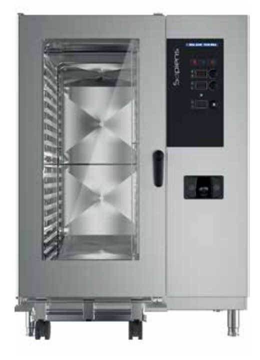
40RSDW (40 × 1/1 GN, 20 × 2 1/1 GN)