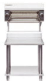
CS9 / C900-S