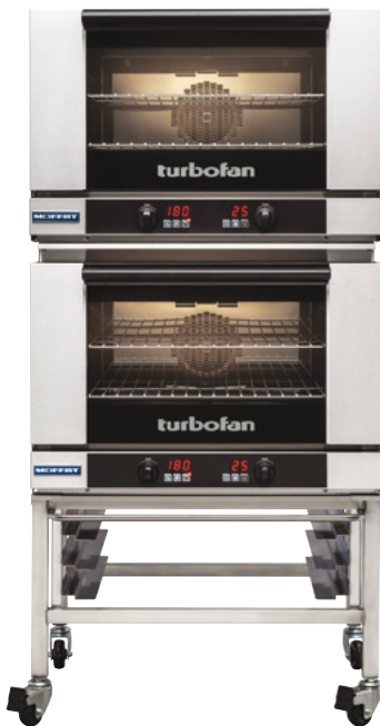
Model E27D2/2C shown

Double Stacked on a Stainless Steel Base Stand