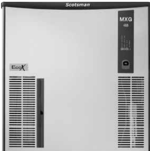
Medium gourmet cube 20g, 30mm dia x H 34mm