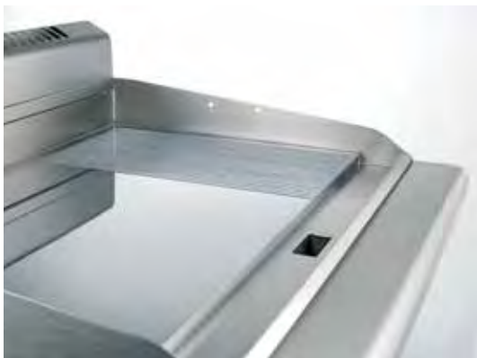
Mirror chromed griddle plate with a combined smooth and ribbed surface.