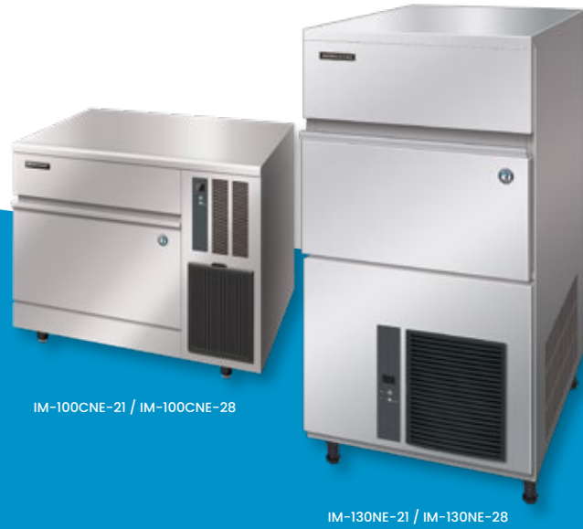
IM-100CNE-21 / IM-100CNE-28