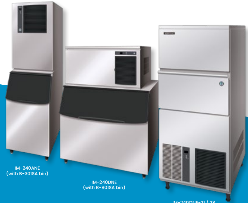
IM-240ANE (with B-30ISA bin)