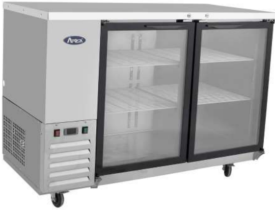
Refrigerated Back Bar Cooler with Glass Door