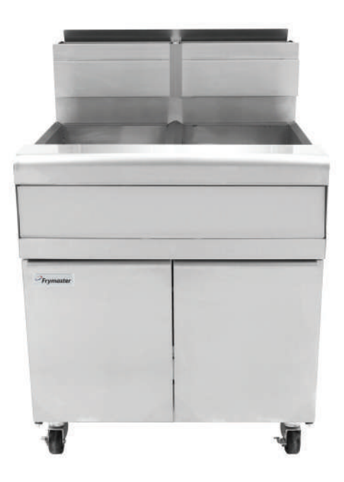
shown with optional castors

SPECIFICATIONS ARE SUBJECT TO CHANGE WITHOUT NOTICE.