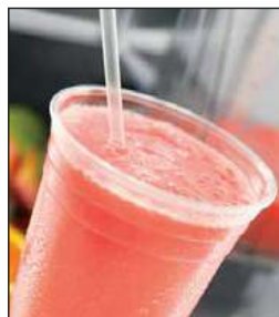
Strawberry Orange Smoothie