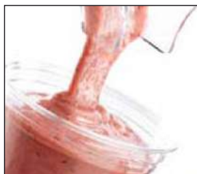
Unique shape and design for faster, smoother pouring.