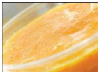
Perfectly blended smoothies.