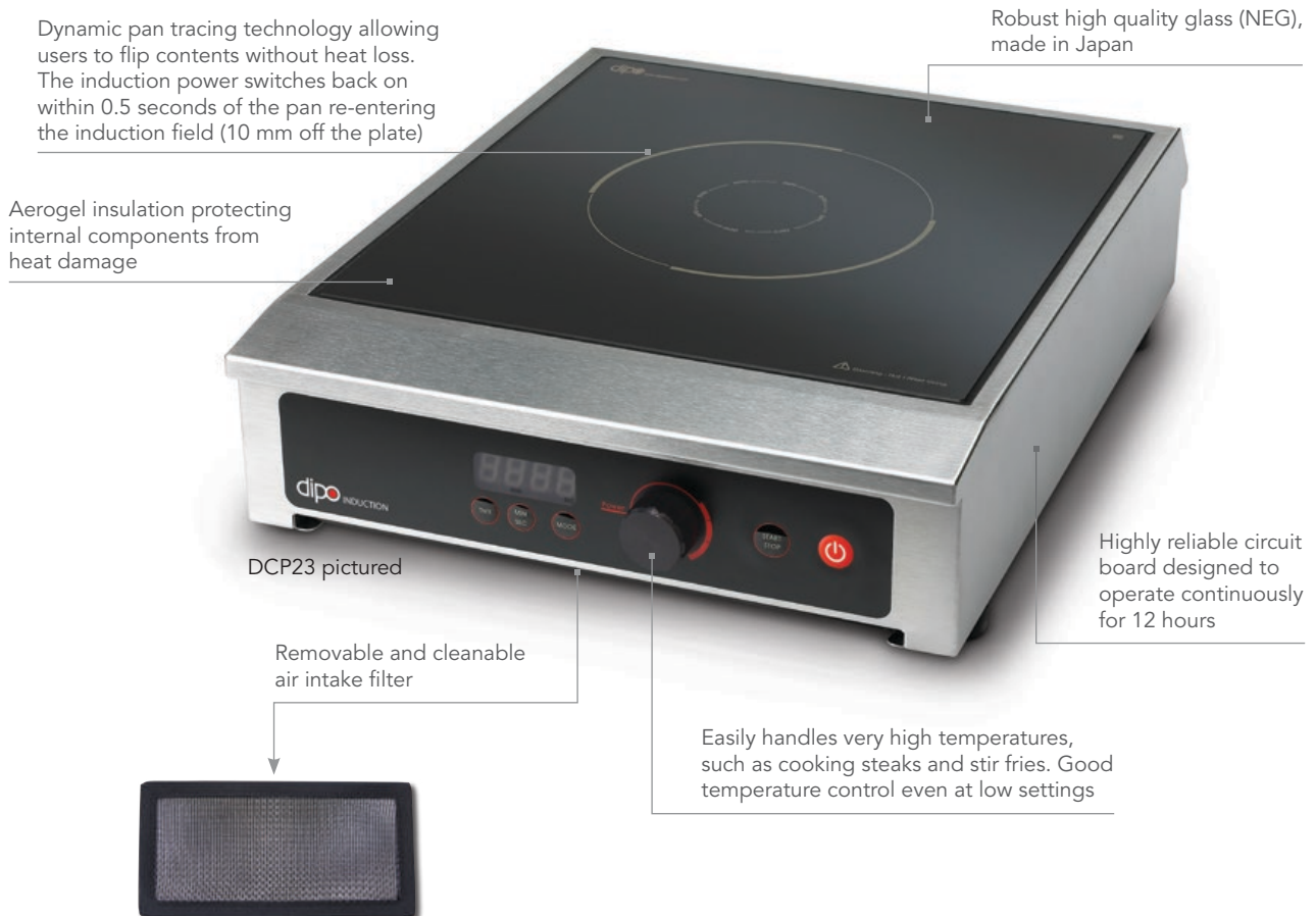
Fast response to controls*

Dipo Induction ranges are made in Korea where the company is solely focused on producing high quality induction machines, designed and manufactured to deliver the highest standards of performance and reliability. They are the market-leader in Korea and many other countries.