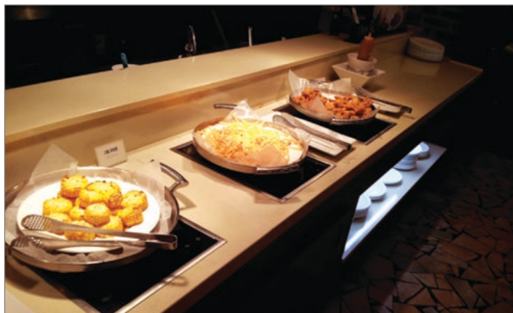
Multiple DWR04's installed with stainless steel trim in buffet counter