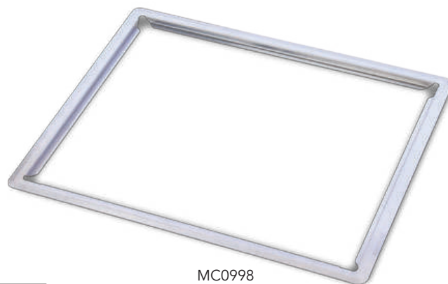
MC0998 Stainless steel trim ring pictured