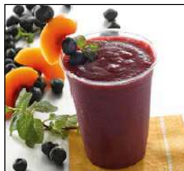
Blueberry peach smoothie.