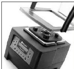
Magnetically secured back cover makes it easy to clean.