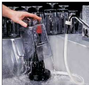
Rinse-o-matic in action.