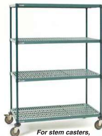
For stem casters, see catalog sheet #11.20

Compatible with the following shelves on the same shelving unit: