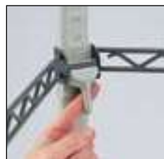
MetroMaxQ Corner Lock Release™