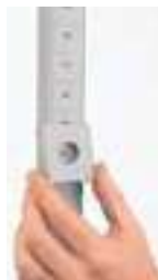
Wedge connector attaches easily to post.