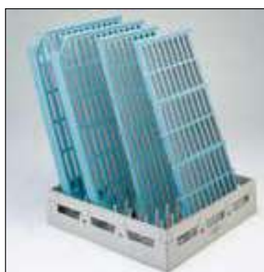
Shelf mat sections fit in the dishwasher for easy, thorough cleaning.