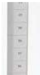
Posts are numbered at 1" (25mm) intervals.