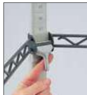
Corner Lock Release™ pulls out easily to unlock shelf for repositioning.