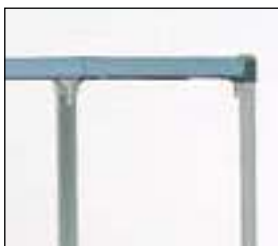
Shelf fits tightly over wedge connector.