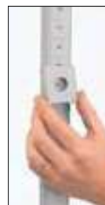
MetroMax Q Wedge Connector Included with each shelf or shelf frame. Bag of 4. Cat. No. Q9985