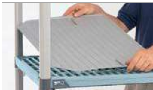
Open-grid shelf mats remove quickly for cleaning.