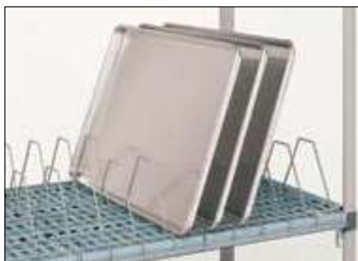
Tray Drying Rack