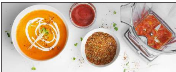
Perfectly chop ingredients